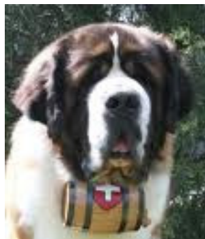
St. Bernard Dog