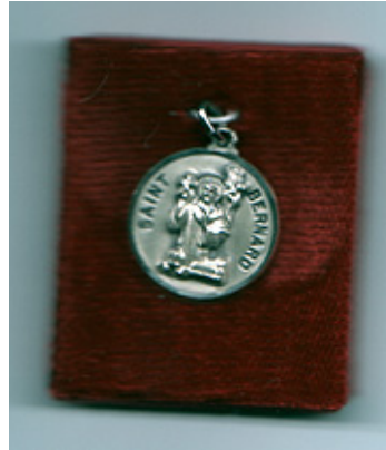
St. Bernard Stirling Medal

Mutt and Jeff every once in a while find a religious medal at the SwapShop. This STIRLING SILVER small silver medal was 18mm which, if it had not been looped would have been 'Dime Size' which is Mutt's speciality.