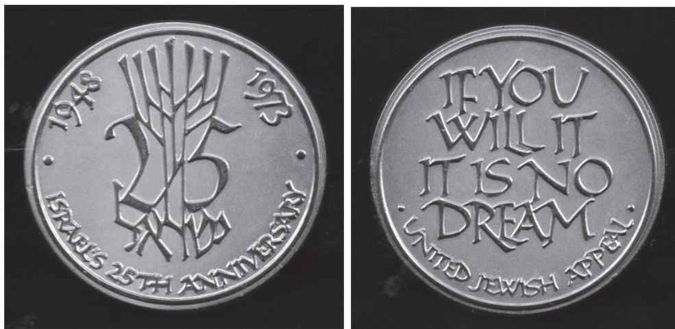
Israel's 25th Anniversary 1948 - 1973